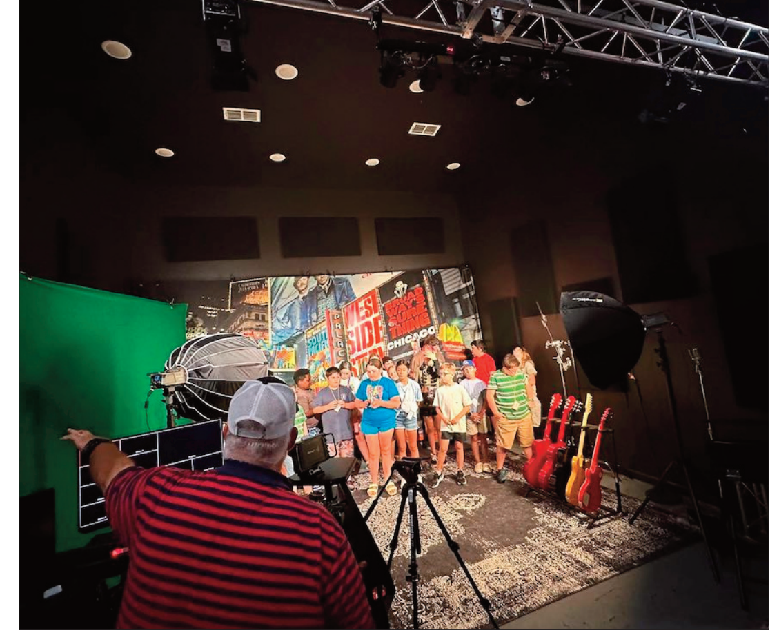
BIG WINN STUDIOS gave students attending the Franklin Parish Library's STEM program a chance to explore music, televison and movie production.