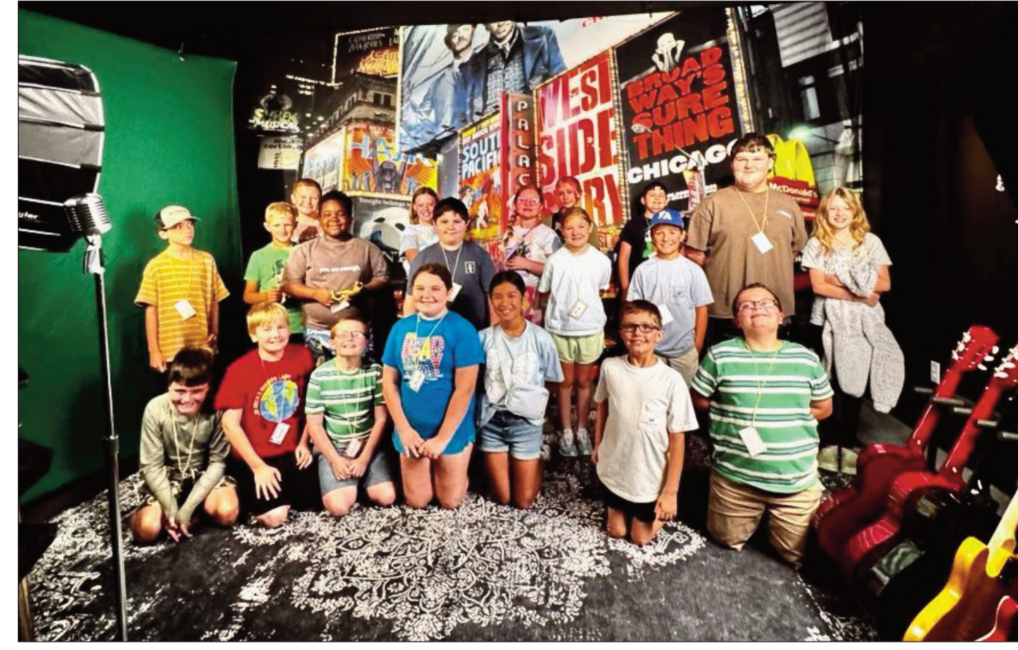
STUDENTS AGES 9- 13 were invited to take part in the STEM program as part of the Franklin Parish Library's Summer Reading. Program.