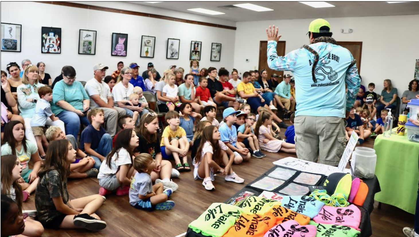
TWO SESSIONS were necessary to accommodate the number of people interested in the popular Louisiana Snake ID program held June 28 as part of the Franklin Parish Library’s Summer Reading Program. The theme for this year’s summer program was “Adventure Begins at Your Library.”